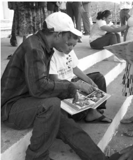
Examining photos from the Historic Memory museum.

The UCA Tribunal takes place every year in a different part of the country. The first Tribunal three years ago took place in San Salvador, last year's was in Suchitoto, Cuscatlan, and this year the UCA Tribunal came Arcatao, Chalatenango. Each year, cases are seen in the categories of summary execution, massacres, disappearances, and torture. In Arcatao, from March 14–16, 2011 the tribunal heard three days of brave and heart-wrenching testimonies of war crimes that happened in each of these categories all in the relatively small region of