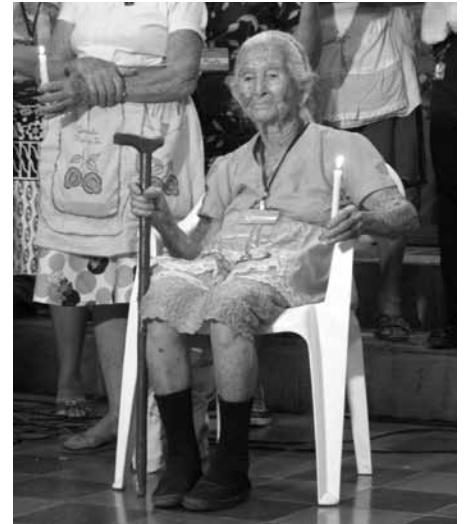
The last witness.

The Human Rights Institute of the Jesuit University of Central America (UCA) began to organize Restorative Justice Tribunals three years ago with two goals in mind.