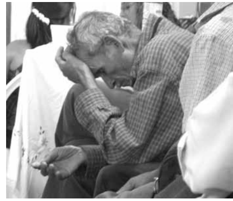
Listening to testimony.