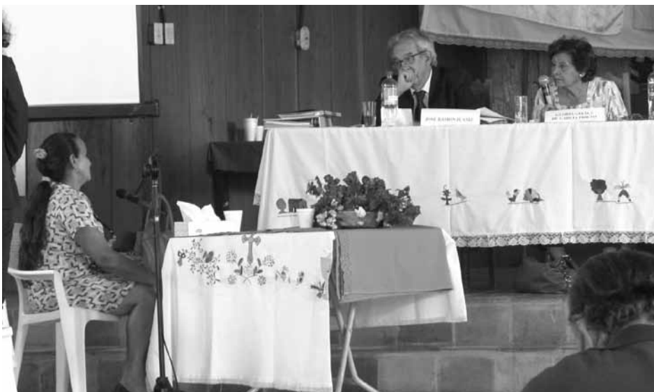
Testifying before the International Restorative Tribunal.